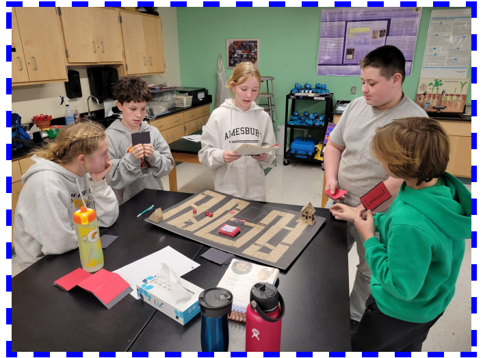
Middle School Math Games

Our Social and Emotional Learning (SEL) focus for this month is "be willing to take risks." This is an essential skill that helps our students grow and develop in various aspects of their lives. By encouraging our children to step outside of their comfort zones, they can explore new opportunities, face challenges with resilience, and develop a growth mindset.